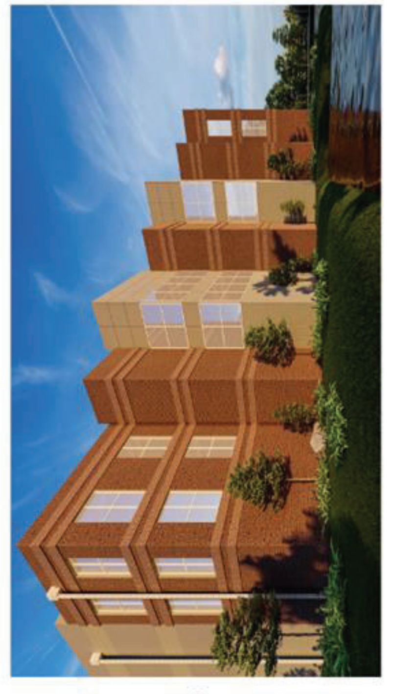
EXHIBIT C Building Renderings