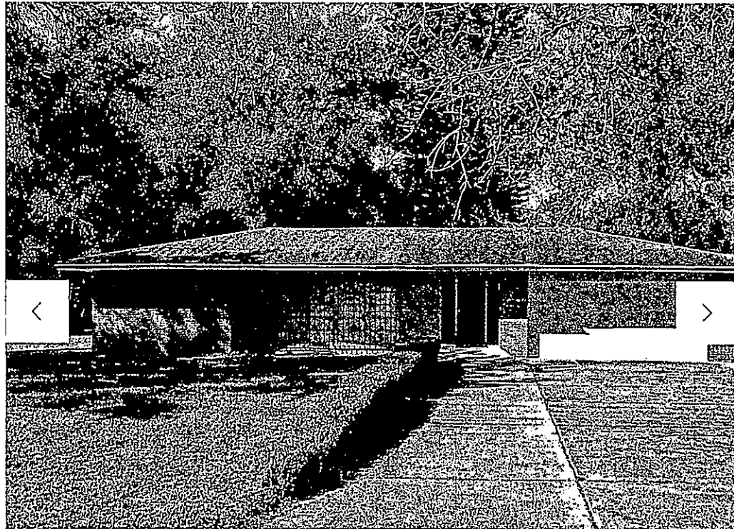
Street View - View in New Window