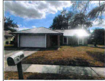
255 FALLEN PALM DRIVE, CASSELBERRY, FLORIDA 32707