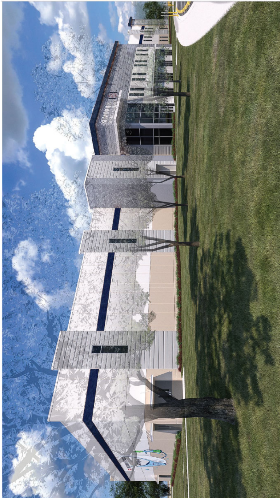
Exhibit C Architectural Renderings