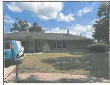
1003 SHEFFIELD COURT, WINTER PARK, FLORIDA 32792