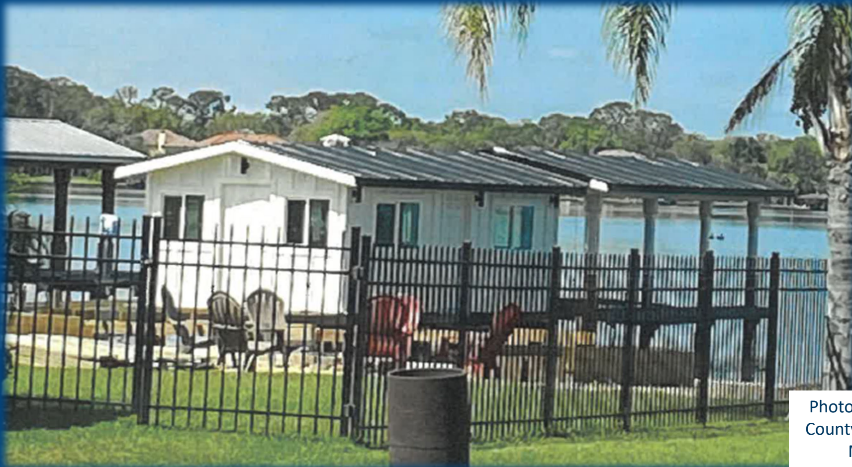
March 7, 2024

March 2024 - The existing dock, boat house, and boat slip