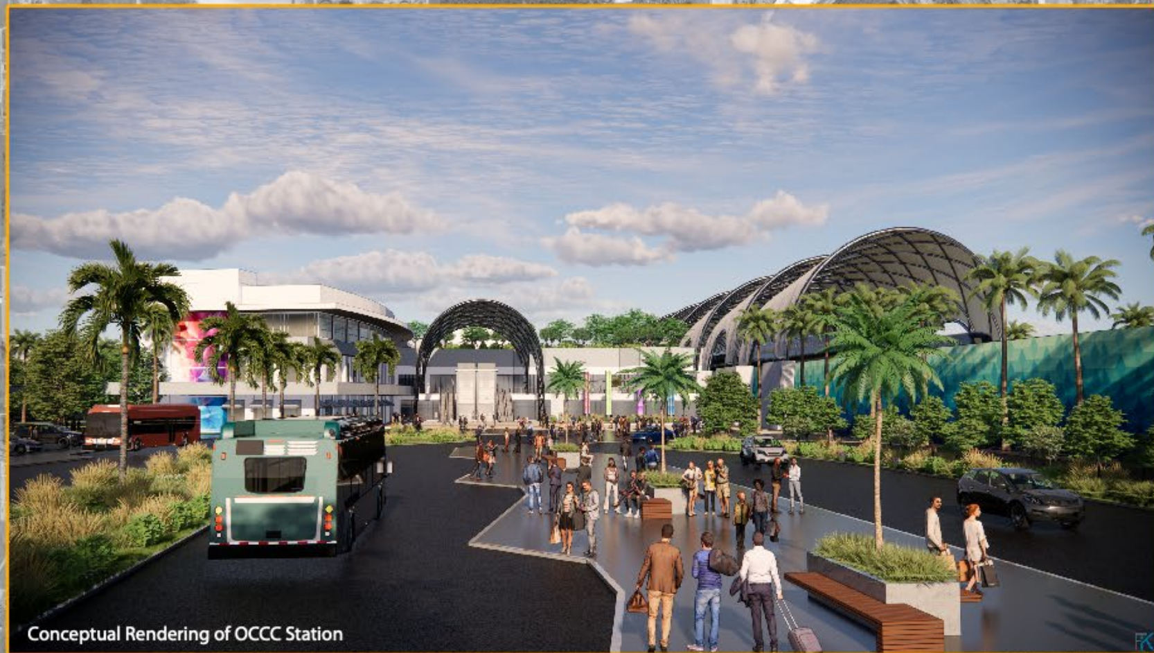
Conceptual Rendering of OCCC Station