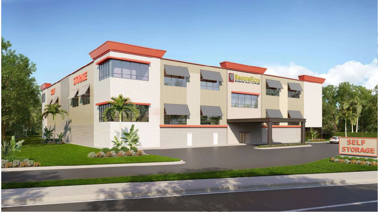
EXHIBIT C Building Rendering