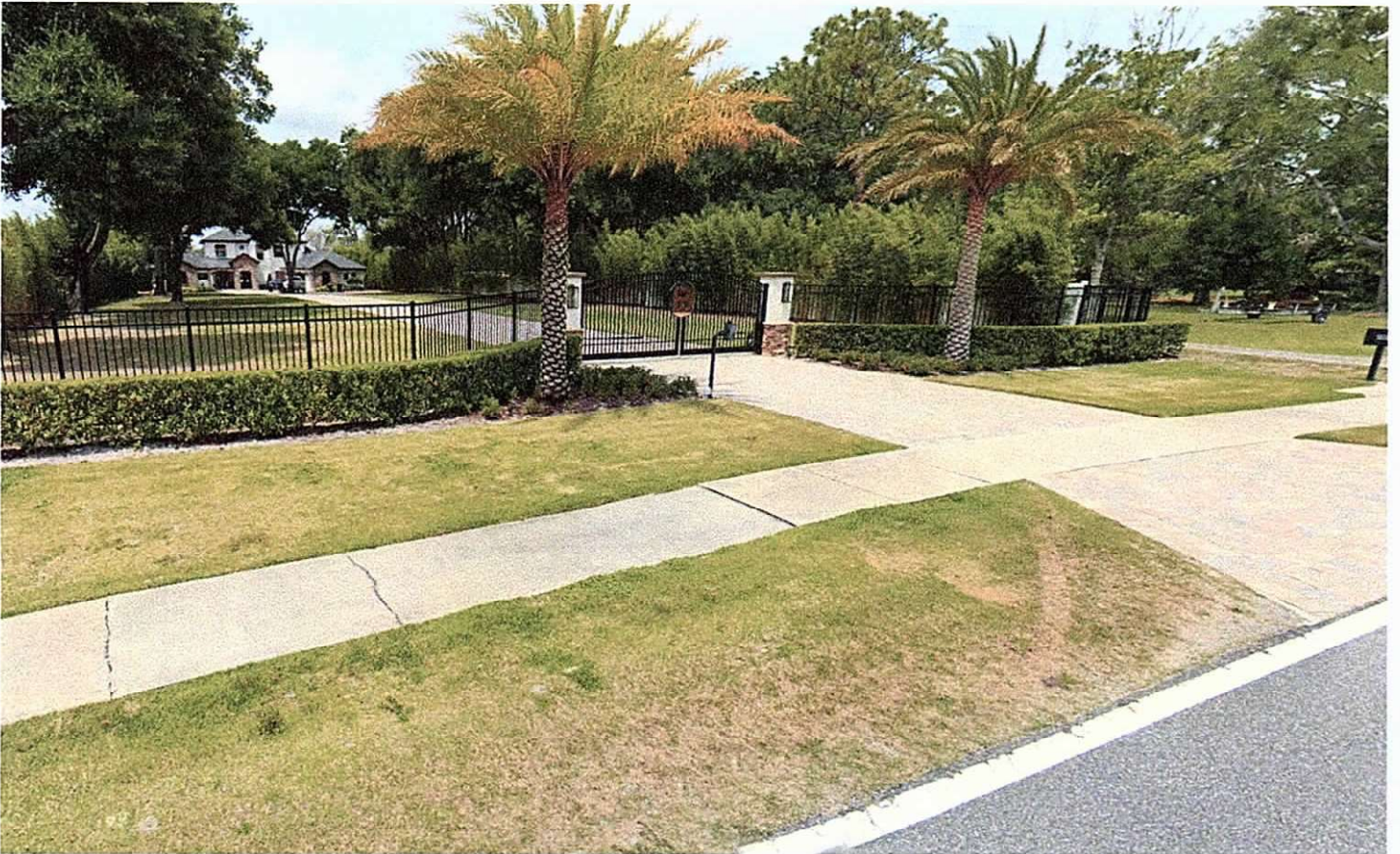
Exhibit for 940 Lake Markham Road variance application

1820 Lake Markham Road – Fence is on property line and columns and gate are setback about 10 feet