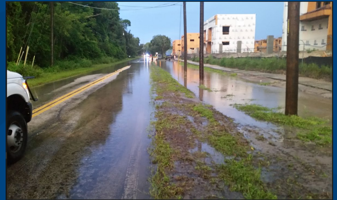
Flooding at 680 Hillview Drive (Looking East towards Matthews Road) Sept. 19, 2016