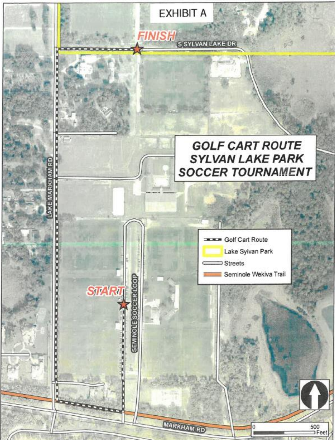
Resolution Authorizing Use of Golf Carts on Lake Markham Road and South Sylvan Lake Drive Exhibit A