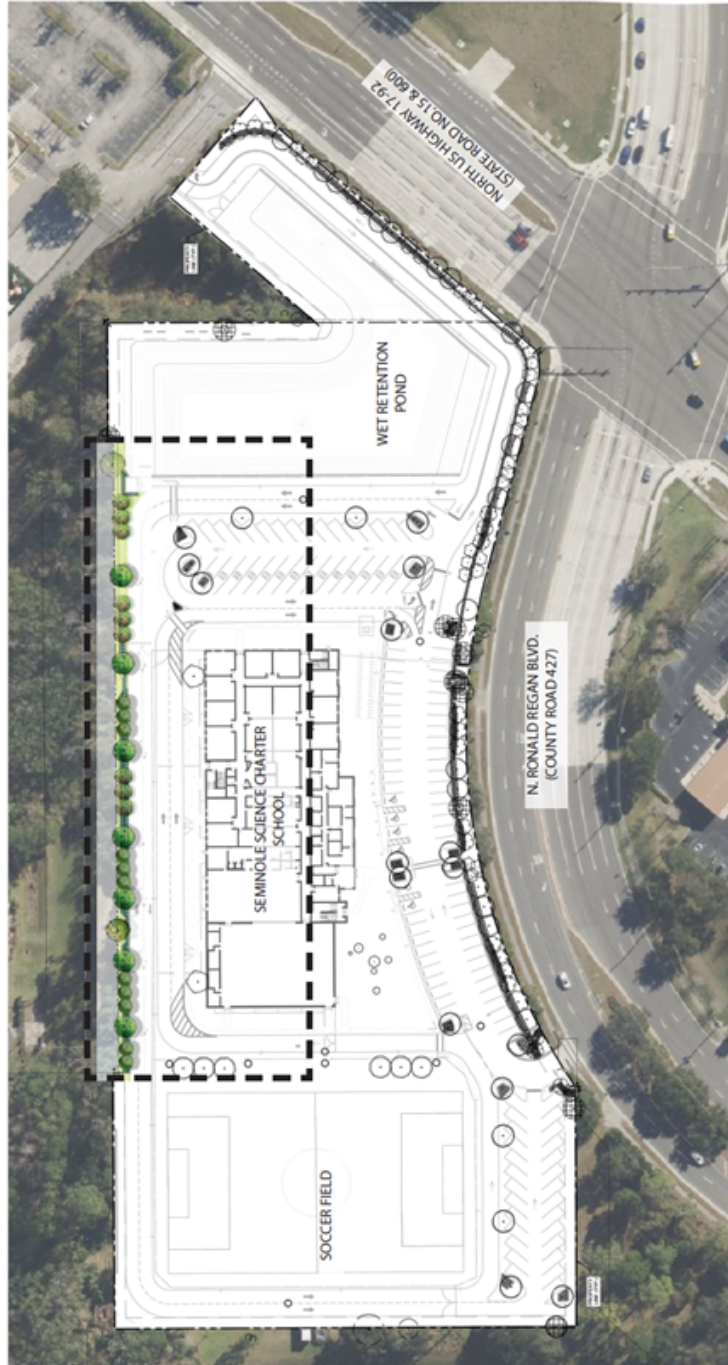
EXHIBIT D NORTH BUFFER EXHIBIT

FILE NO. PZ2024-013 DEVELOPMENT ORDER # 24-20500006