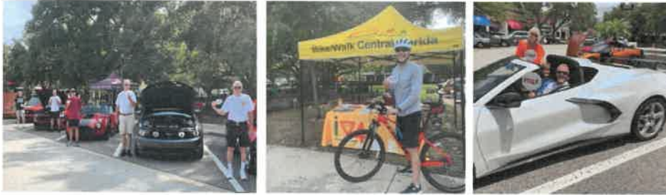
Mustang drivers support BFF mission