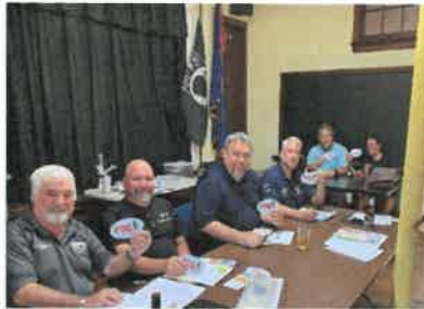
VFW Post Board Members holding iY4P Magnets

Presentation: East Seminole County VFW Post 10139 (Seminole County)