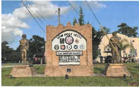
VFW Post 10139 sign