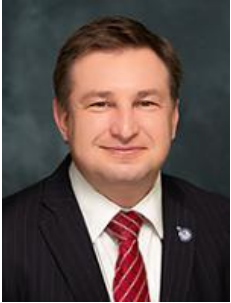
SENATOR JASON BRODEUR DISTRICT 10